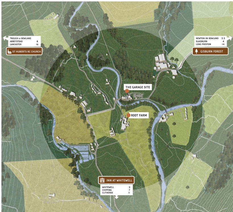
Dunsop Bridge Map

This leaflet relates a long term and strategic vision for Dunsop Bridge. It initially focuses on two sites within the Duchy of Lancaster's ownership within the Village: the old Garage site by the village green and Root Farm Buildings as shown on the plan. Given the current economic uncertainty, the timing and phasing of any strategic development remains uncertain. What is certain is that we would very much like your community input and all feedback and ideas are very welcome in these early stages.